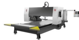
GR 712 8100 RPM SPINDLE X 145" Y 85" Z 11"