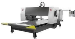
GR 510 5000 RPM SPINDLE X 120" Y 60" Z 7.5"