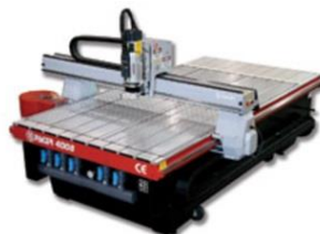
PACER ROUTER 4012ATC VACUUM TABLE X144" Y60" Z4"