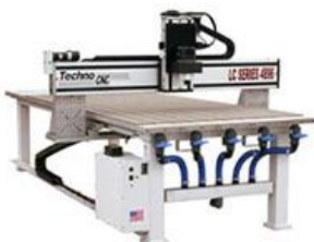
Techno Router with Vacuum Table X 120" Y60" Z 3"